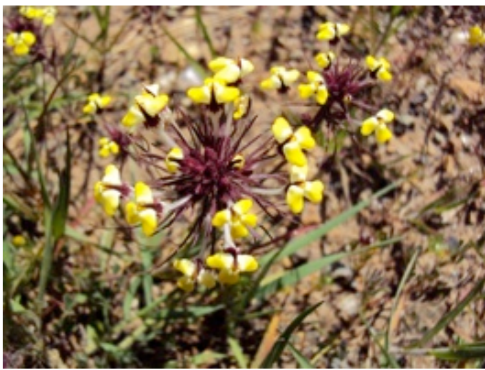
Butter and Eggs, also a common native plant in the neighborhood