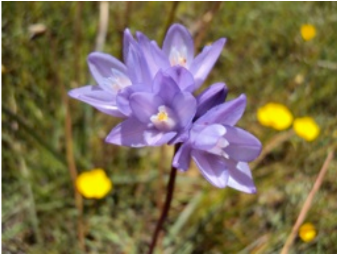
Blue Dicks, growing in Ridgewood.